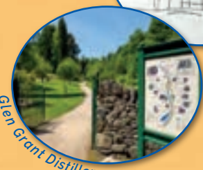
Glen Grant Distillery